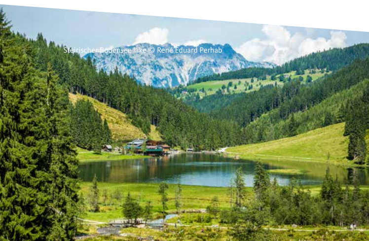
Stairischer Bodensee lake