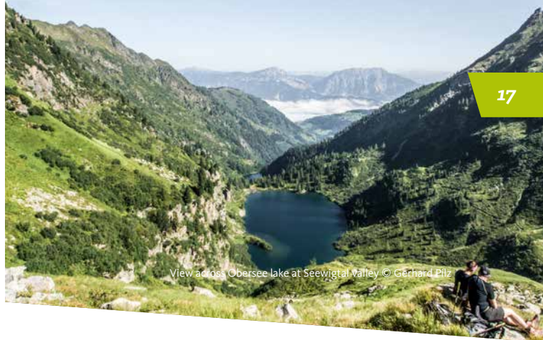
View across Obersee lake at Seewigal valley

Passing by along the slope above the lake you reach Hans-Wödl-Hütte where you deserve a stop to enjoy some refreshments. After taking a break at the hut you continue your way down into the valley along the well-maintained hiking trail. Shortly before reaching the Steirischer Bodensee lake you can make a small side trip (2 minutes) to a waterfall. Along the shore of the