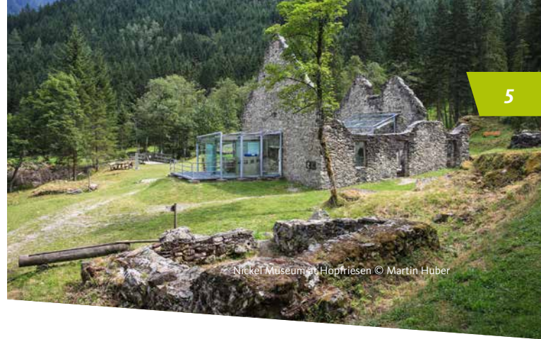
Nickel Museum in Hopfriesen

Mining in the Schladminger Tauern range also brought about historic milestones such as the » Schladminger Bergbrief « – a document from 1408 which for the first time summarised the rights of miners and has significance worldwide. Even today this document is referenced in court procedures. The social service »Schladminger Bruderlade« also goes back to the mining history. The town museum of Schladming – formerly the »Bruderlade-Haus« of the miners – and the Nickel Museum in