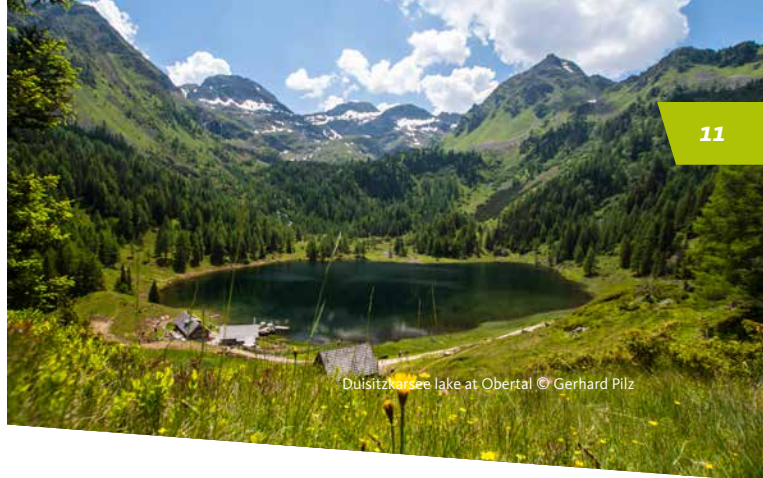
Duisitzkarsee lake at Obertal

From Duisitzkarsee lake a hike of 1 hour (vertical descent of 450 m) takes you to Eschachalm in Obertal valley, where the hiking bus takes you to Rohrmoos and Schladming.