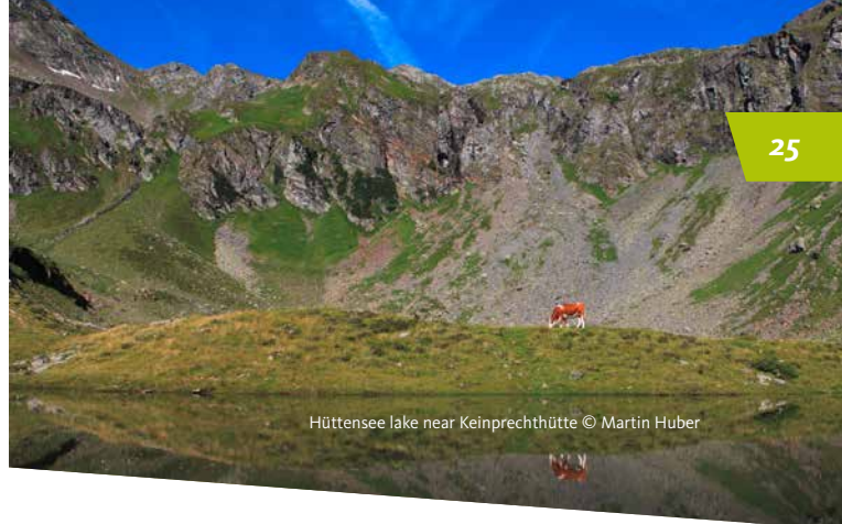
Hüttensee lake near Keinprechtthütte