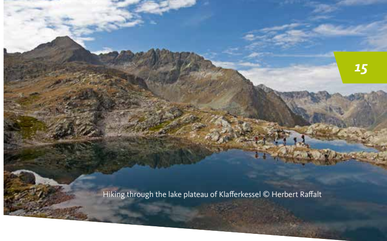
Hiking through the lake plateau of Klafferkessel

From Gollinghütte take path #778 through Steinriesental valley to Seeleiten trail head in Untertal valley (2 hours and 570 m change in elevation). From there take the hiking bus back to Rohrmoos and Schladming.