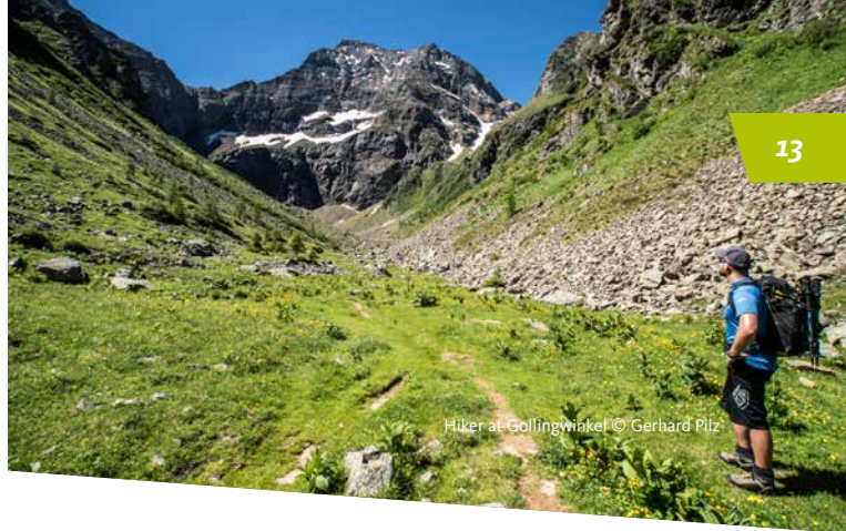
Hiker at Göllingwinkel

Eventually, from the Gollingscharte, you will hike down to the Göllingwinkel , where you will find yourself in