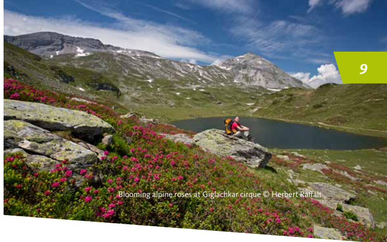
Blooming alpine roses at Giglachkar cirque