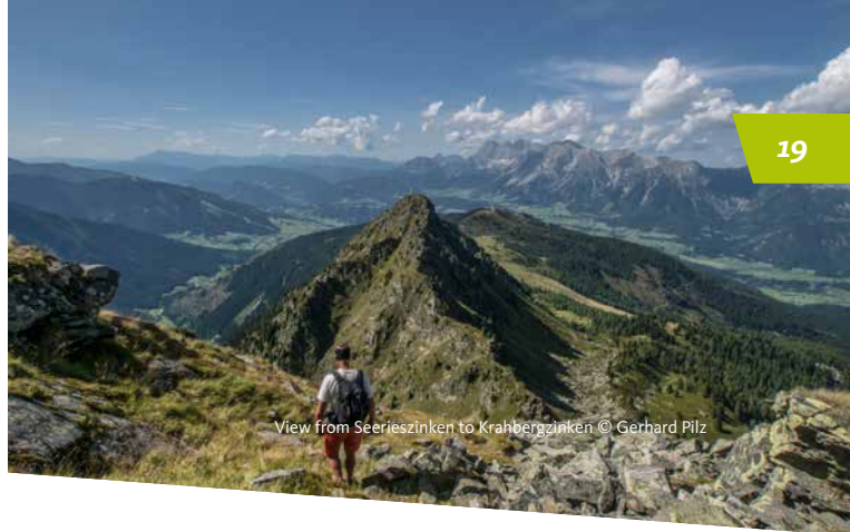
View from Seerieszinken to Krahbergzinken