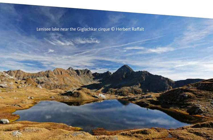
Lenisee lake near the Giglachkar cirque

You answer this way: If you become aware of someone making an emergency signal, respond with your own, this time 3 signals at 20-second intervals for a minute. At this point, begin your rescue efforts.