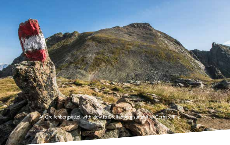
At Greifenbergsattel, with view to Greifenberg summit