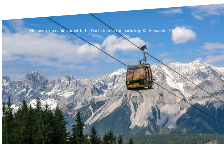
Hochwurzen cable-car with the Dachstein in the backdrop

The hiking buses of Planai-Hochwurzen lift company service the valleys of Preuneggtaal, Obertal, Untertal and Seewigtal. The buses run daily during Sommercard season (usually between end of May and end of October). Bus schedules are available as brochure in the tourist office or available online at www.planibus.at .